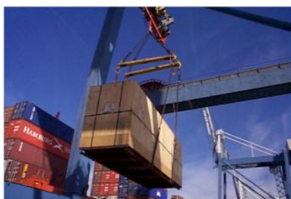
Carolina exports bound for Canada