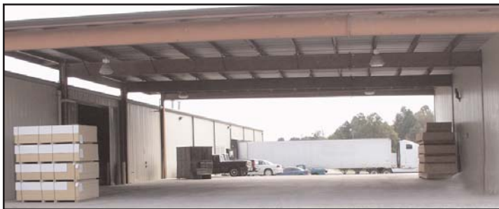
GIS Sequence # 8165